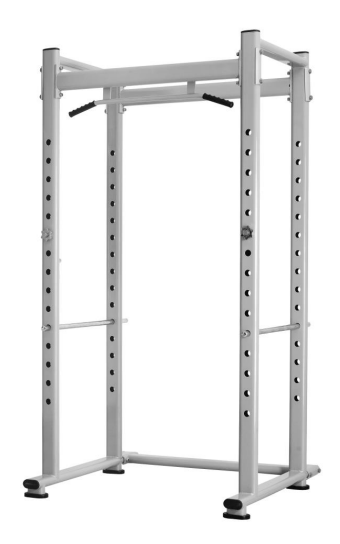
K-21 SOUAT RACK

Exercise position: Biceps Femoris, Quadriceps Femoris